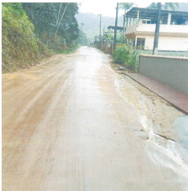
RUA ANTIGO POSTO DE SAÚDE