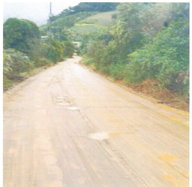
RUA DIVISA ALFREDO CHAVES