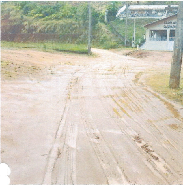
RUA DO CAMPO