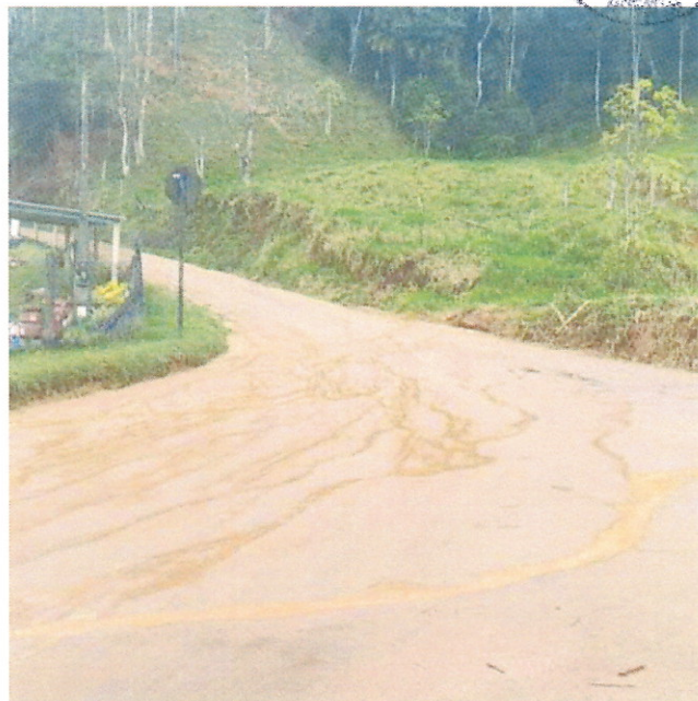
RUA SUBINDO A ENTRADA DE TODOS OS SANTOS