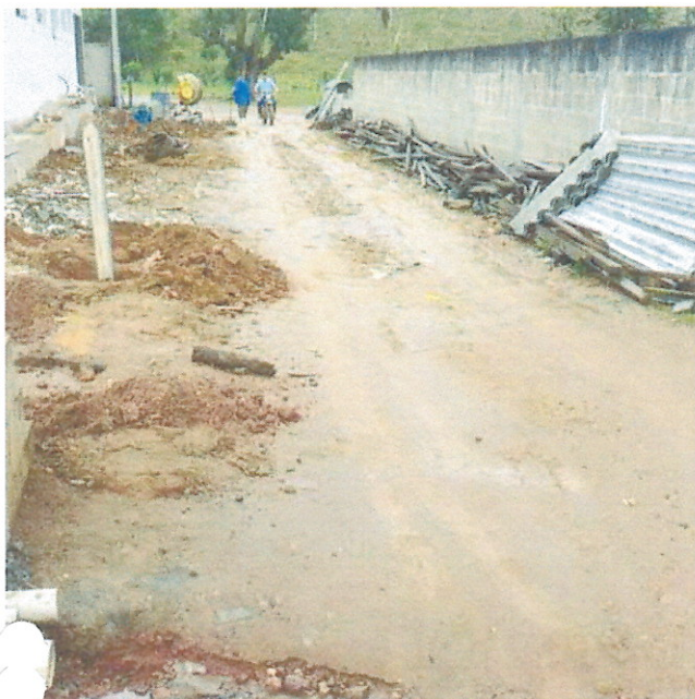
RUA NOVO POSTO DE SAÚDE