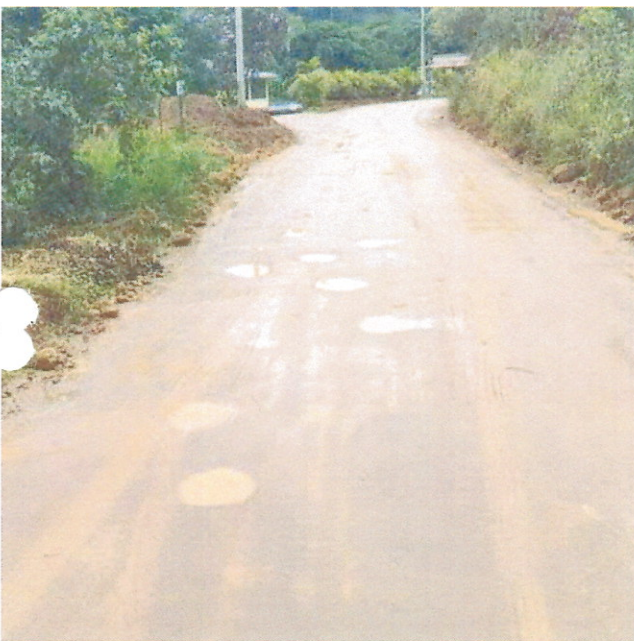
RUA DIVISA ALFREDO CHAVES